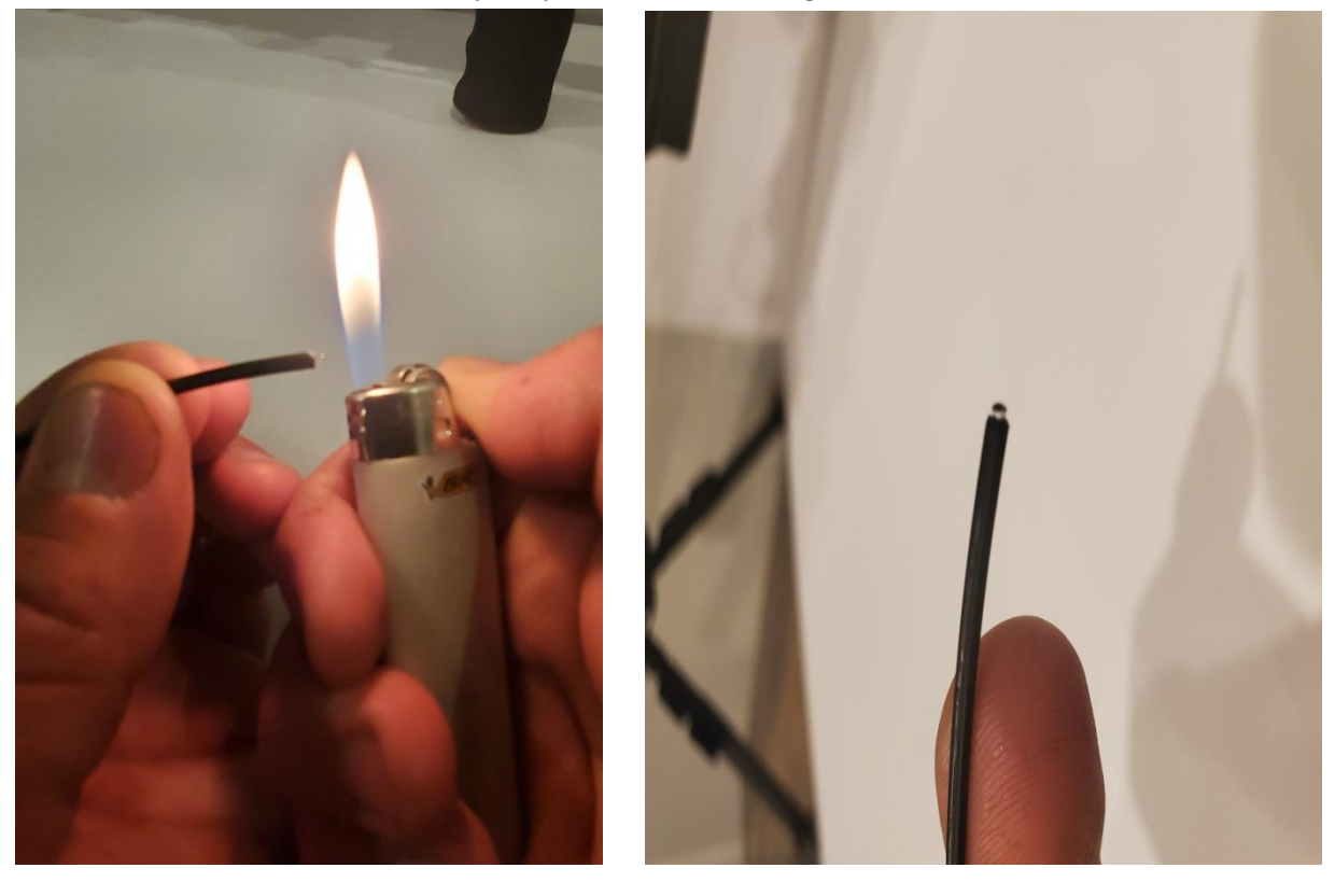
(1 end of the 36" fiber is prefinished for example)

dome the end of the fiber to better pickup and transmit the light.