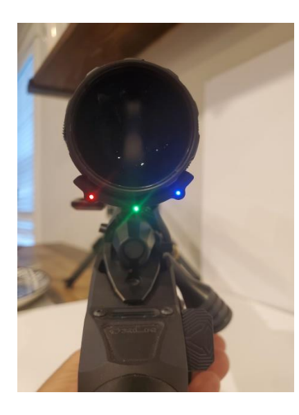
Lean away from the red/blue

Step 6 Decide which way you prefer to get to plumb/Green (see pictures below)